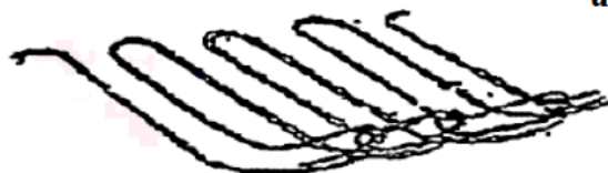
CATCH CORD DIAGRAM

Selvage locked by knitting filling loops simultaneously with additional catch thread using incline latch needle